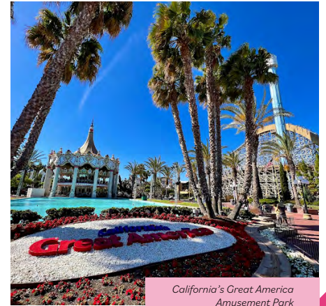
California's Great America Amusement Park