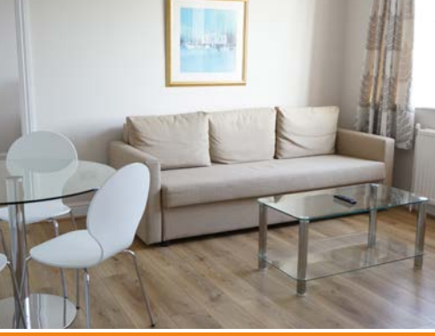
2 Chelsea Cloisters ****