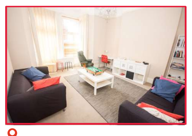
Y Terenure Residence